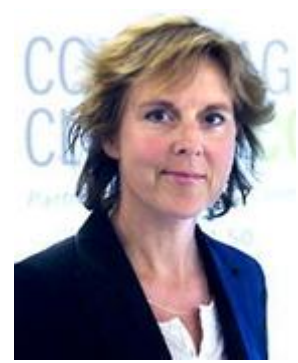
Climate Change Commissioner designate: Connie Hedegaard (Denmark)

organising the UN Climate Summit held in Copenhagen in December 2009.