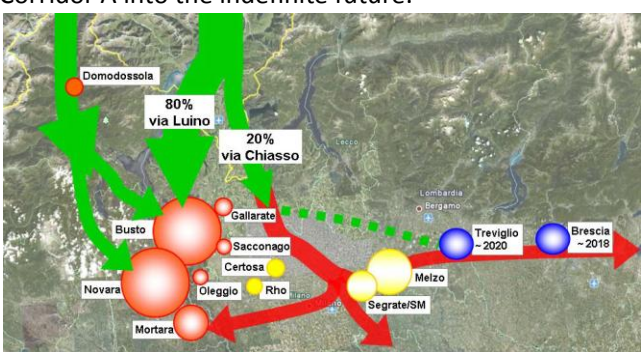
For more details click:

Neglect of the Luino line, the Western bypass route of the Milan area for 80% of unaccompanied CT today, in favour of the "politically preferred" Chiasso line where freight trains would have to pass through the busy Milan region – is a major mistake that will prolong the reaching of the train-length, -weight and profilegauge extension targets along the entire ERTMS Corridor A into the indefinite future.