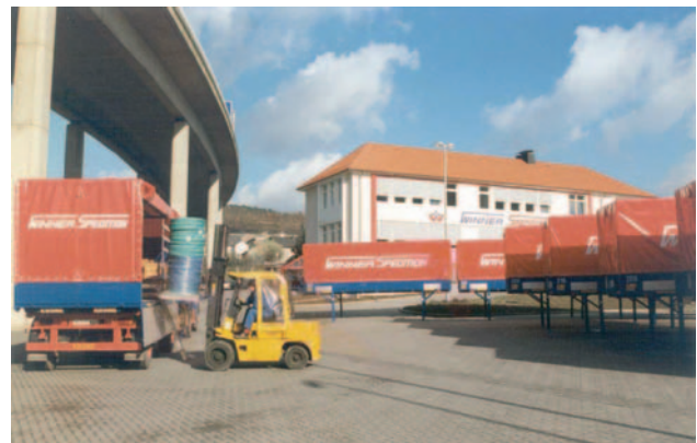
Lateral loading of a swap body

loading unit mainly from the standpoint of short sea shipping and inland navigation. And in fact, if the new pallet-wide eurocontainer is compared with traditional ISO containers, there are productivity increases due to the larger volume. These are, however, purely theoretical, as in practice pure road vehicles or swap bodies have gained acceptance in continental transport precisely because they have for a long time achieved this increased volume and additionally – which is completely overlooked – weigh less and are more universal: they can be loaded from all sides and, unlike the container, put down or trans-shipped between road vehicles without any crane, only by means of air suspension. On the basis of its stronger construction ensuring top-lift and stackability, a container weighs more than a swap body (which consequently can transport a greater payload) and which is already at a disadvantage as compared with a road vehicle with fixed superstructures which can transport a payload of two to three tons more per road train.