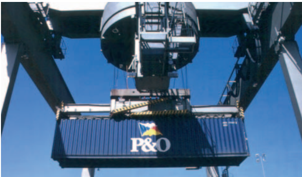
Container (from above cranable)

The EU Commission now omits the underlined words and adds above to the requirements for all loading units: „ ... and take into due account the existing relevant ISO standards“.