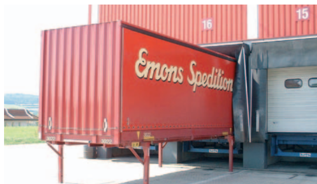
Swap body at the loading ramp

It should not be forgotten that the basis of our economy is free competition. Road transport offers great flexibility and is in a position to adapt to a large extent to the wishes of shippers, diversity of products and possible loading and unloading conditions. Rail and inland waterway modes require more technical restrictions. The basic philosophy of the UIRR companies is that as far as possible everything that can be transported by road should also be transportable by combined transport. As the result of investment in multi-purpose wagons, most loading units of varying length dimensions and volumes developed by logistics firms can now be transported in combined road-rail transport.