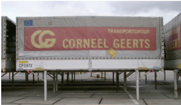
Swap body on feet

page: „International transport is a major target for terrorists, smugglers, thieves and stowaways.“ Hence „new ILUs should be fitted with the best available anti-intrusion alarm devices (for example, a state-of-the-art electronic seal) ...“.