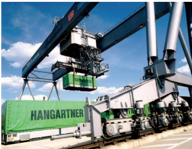
Swap body (from below cranable)

It appeared logical and conducive to security to subject all loading units in the future to regular inspections. However, the UIRR advocated no more frequent or stricter controls than those provided for in the Container Safety Convention (CSC) which is applicable on a worldwide basis. The European Parliament endorsed this view.