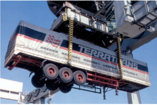
Semi-trailer (from below cranable)

The EU Commission now omits the underlined words and adds above to the requirements for all loading units: „ ... and take into due account the existing relevant ISO standards“.